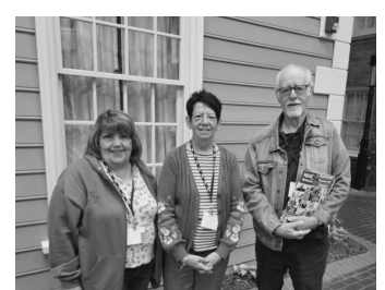
Pictures Left to Right: Buffalo Educational Support Team (BEST) Retiree Luncheon: