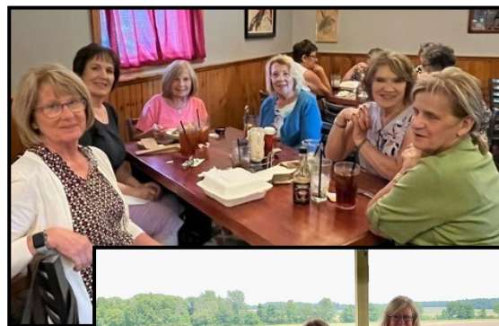
JUNE 5 Seneca Bus Trip Parkers Grille