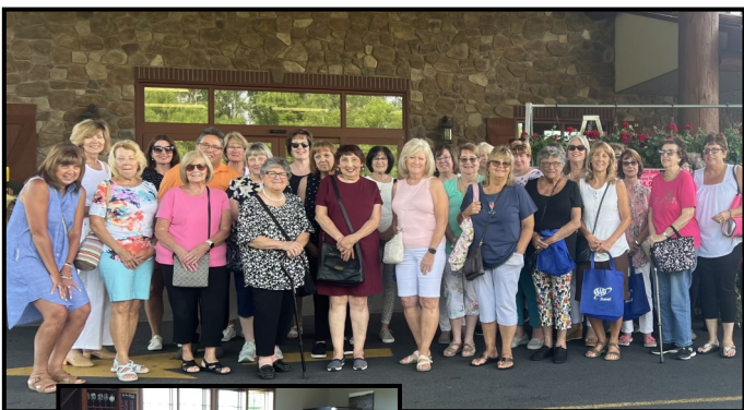
Sauders Country Store

Questions? Contact Lynn Mele at (716) 632-2975 http://rcwest.ny.af